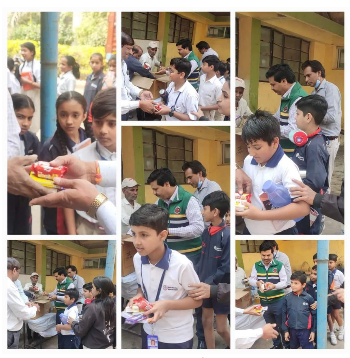
15) Visit to ZOO in Indore by students of grade LKG TO 3<sup>rd</sup>, a trip full of enjoyment, enthusiasm, education, and emotions.